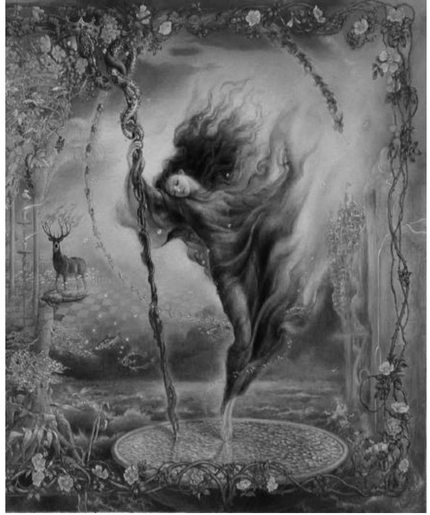
Alphabet of Thorns (c) Kinuko Y. Craft at www.kyecraft.com and www.dai-ri-waighgallery.com (image cropped)